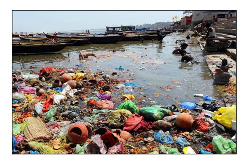
Figure 2. Pollution of water sources by indiscriminate littering

Although great efforts have made in implementing environmental protection policies and laws, environmental pollution, especially water pollution, has been becoming increasingly serious in Vietnam [2]. Water sources in some areas are polluted, especially in urban areas and surrounding industrial areas. In river basins, water quality pollution and degradation are concentrated in the middle and downstream areas (Fig 2).